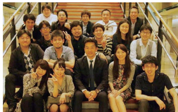
Group photo of the laboratory members

In April 2012, together with the Ubiquitous Communication Laboratory, the Smart System Design Laboratory established a "smart space", which functions as both a workshop venue and a design studio in the West Building of Hiyoshi Campus. Students were the main contributors to creating this smart space, from designing the space to doing painting. It now hosts various events, such as workshops for local and business communities, prototyping using a 3D printer, receiving satellite signals, as well as functioning as a work base for the laboratory.