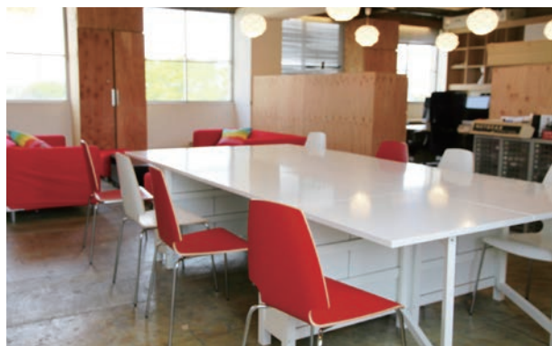
Design Studio (West Building, Hiyoshi Campus)