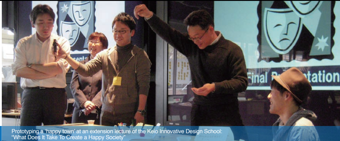
Prototyping a 'happy town' at an extension lecture of the Keio Innovative Design School: "What Does It Take To Create A Happy Society"