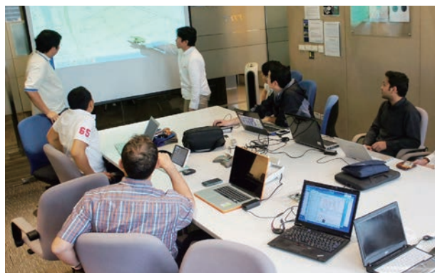
Joint demonstration experiment for the "smart city" with the Asian Institute of Technology, Chulalongkorn University, Tokyo University of Marine Science and Technology, the University of Tokyo and other relevant companies in Bangkok