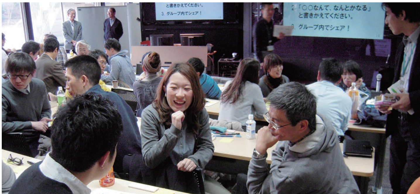
The Workshop for Becoming Happy