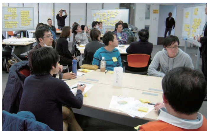
The Workshop on How to Create 'Happy Town' to Live in