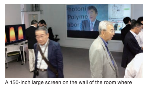
KPRI's findings were demonstrated.

A GI-POF network is available not only in the room where KPRI's demonstration was conducted but also in the entire building (Building No. 34), i.e., transmission